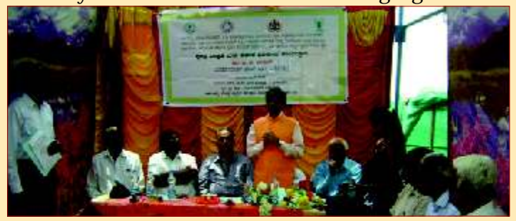
Southern Red Soil Region-Tapasihalli, Doddaballapur Taluk, Bangalore Rural District.

In view of promoting Intergrated farming systems under the endowment fund of Dr. G.K. Veeresh, four field days were conducted in the following regions: