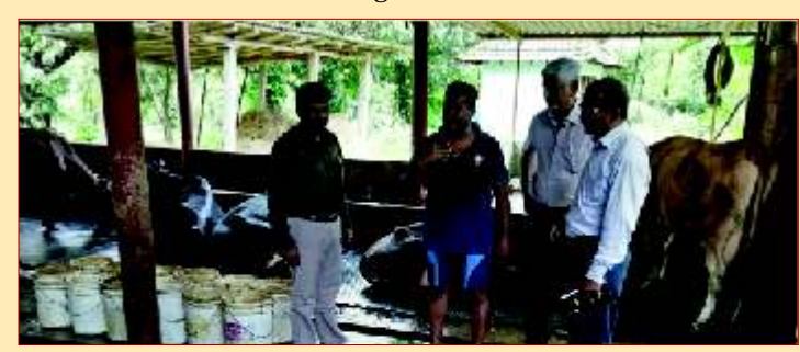
Coastal Region-Perdoor, Hiriadka, Udupi District.