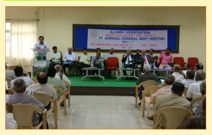
The 34<sup>th</sup> Annual General Body meeting of the Alumni Association was held on 16<sup>th</sup> December 2017.