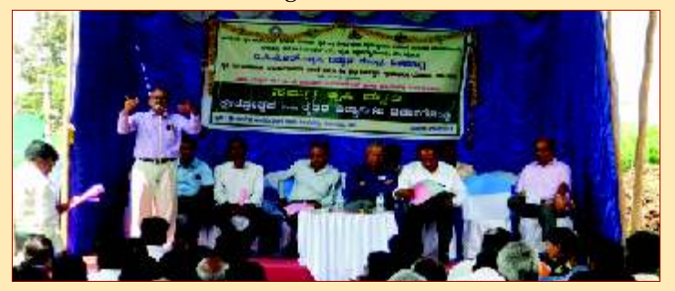
Malnad Region-Sasarvalli, Udri post, Shikaripura Taluk Shimoga District.