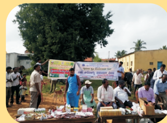
Animal Health Camp at Alagudu village, Srirangapatna Taluk