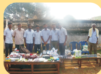
Students of College of Agriculture, Mandya with medicine kits at Jakkannahalli Srirangapatna taluk