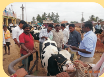
Treatment by veterinary doctors at Uramarakesalgere