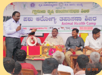
Animal Health Camp inauguration at Uramarakesalgere