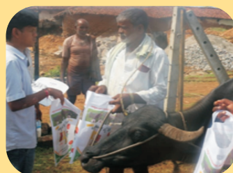
Students of College of Agriculture Mandya distributing medicine kits to farmers at Jakkannahalli, Srirangapatna taluk