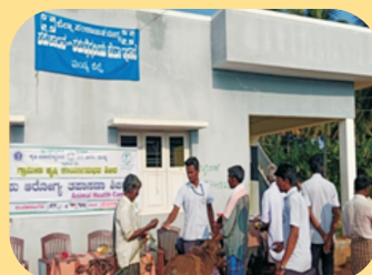
Vaccination for animals at health camp Santekesalgere, Mandya taluk