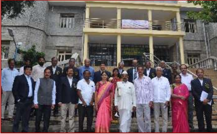
Dr. G. K. Veeresh Endowment IFS Award winners - 2020 with the dignitaries and EC members