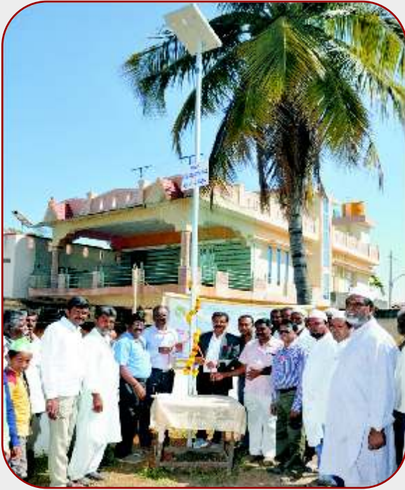
Solar Energy and Installation of Solar Street & Home Lights , Programme held on 12-2-2021 at Kannamangala Palya, Devanahalli Tq, Bangalore Rural Dist.