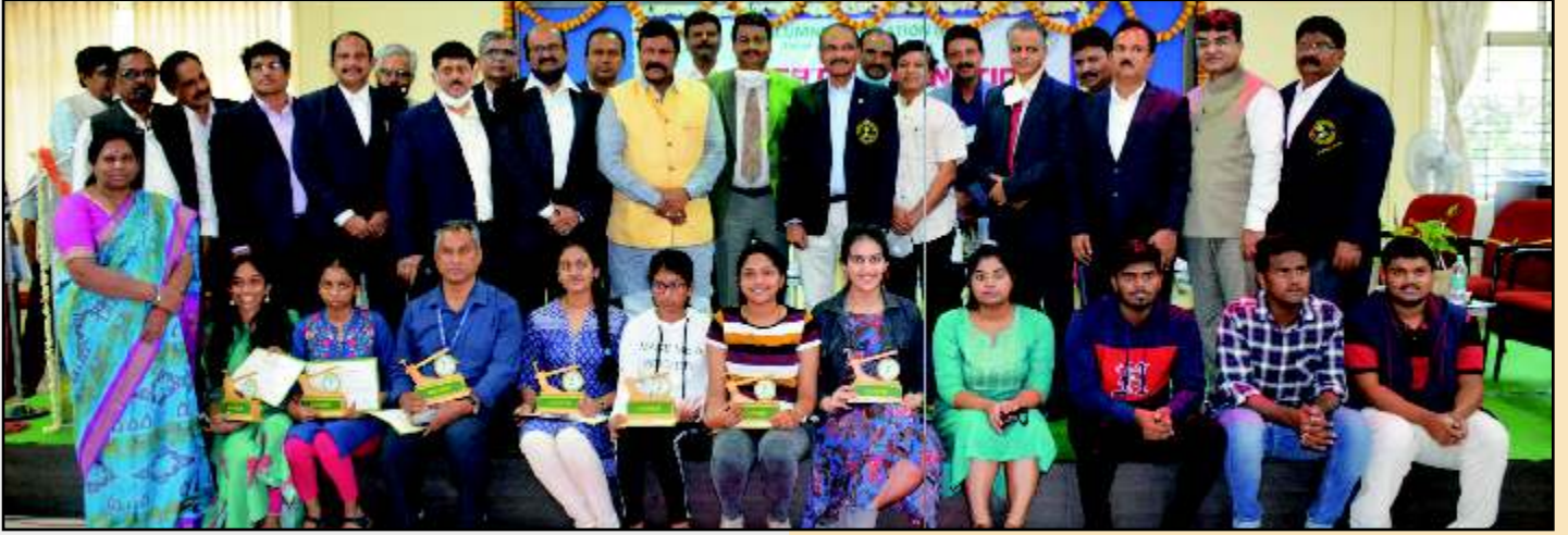
Children of Alumni with Academic Excellence