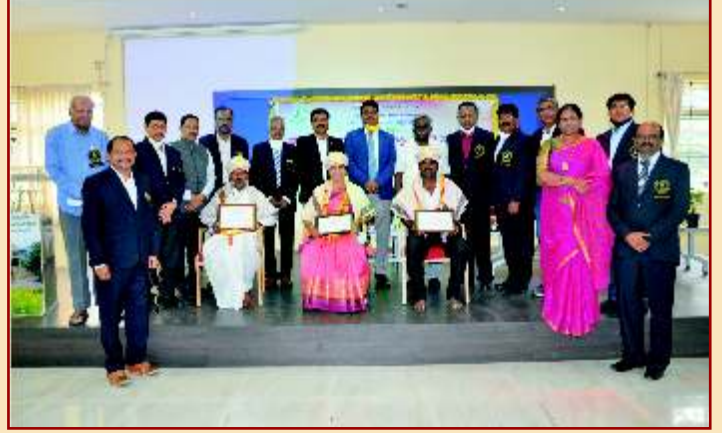
Dr. G. K. Veeresh Endowment IFS Award winners - 2020 with the dignitaries and EC members