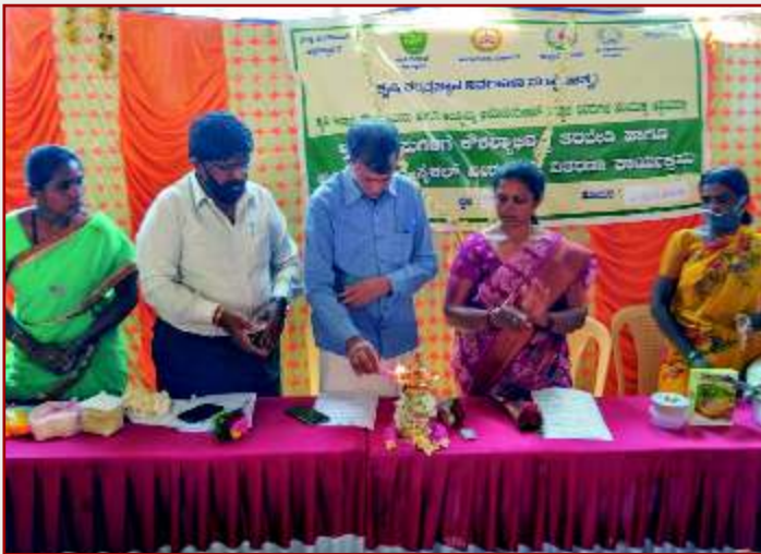
Inauguration of Training Programme at Gowribidnur