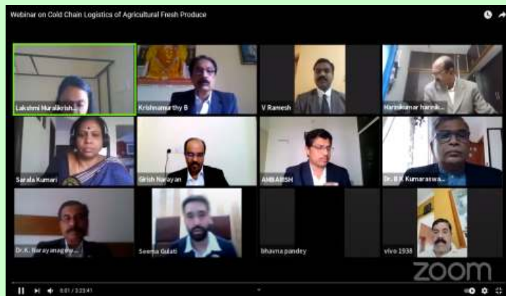
Webinar on cold chain logistics of Agricultural Fresh Produce