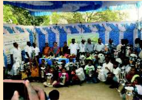
Awareness on Clean Milking & Distribution of "Milk Cans" to farmers at Kanuvanahalli, Nelamangala Tq