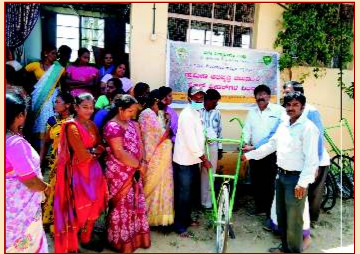
Distribution of "Cycle Weeders" to Farmers at Gowribidnur