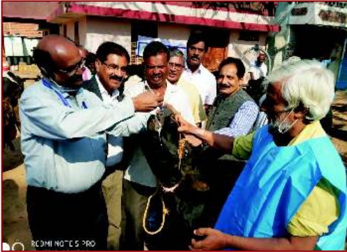
Health Camp at Ibasapura Village, Channarayapatna Hobli, Devanahalli, Tq