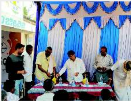
Awareness on Clean Milking & Distribution of "Milk Cans" to farmers at H. Kodihalli Mandya Dist.