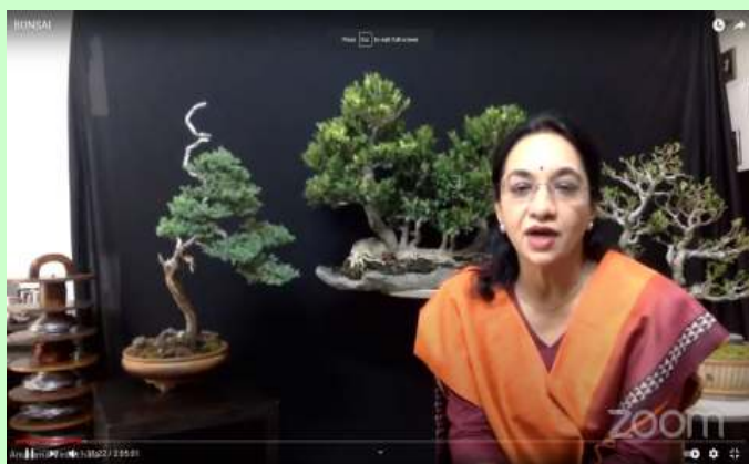
Webinar on Bonsai cultivation