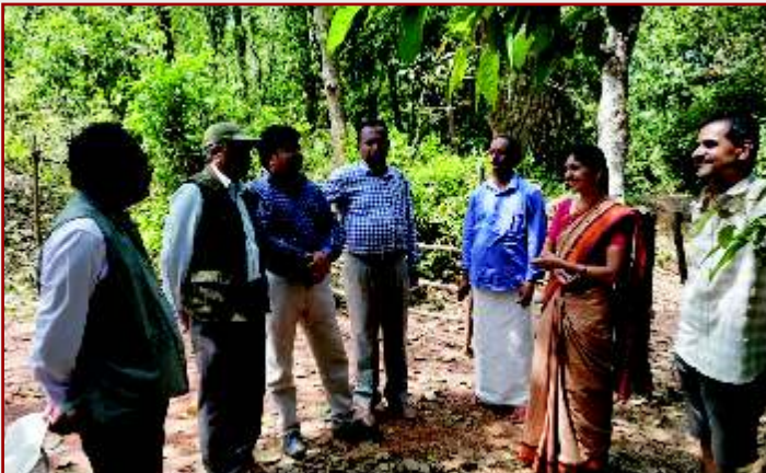
Field evaluation for selection of farmer for Prof.G.K.Veeresh IFS Award - 2020-21 (Malnad Region)