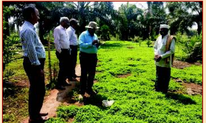
Field evaluation for selection of farmer for Prof.G.K.Veeresh IFS Award - 2020-21 (North Karnataka)