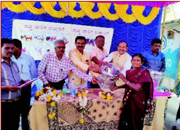
Distribution of "Milk Cans" to Farmers at Swandenahalli, Tumkur Tq, Dist.