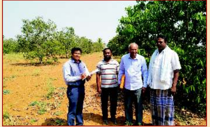
Field evaluation for selection of farmer for Prof.G.K.Veeresh IFS Award - 2020-21 (South Karnataka)