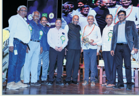
Sri Krishna Byregowda Hon'ble Minister for Revenue, GoK